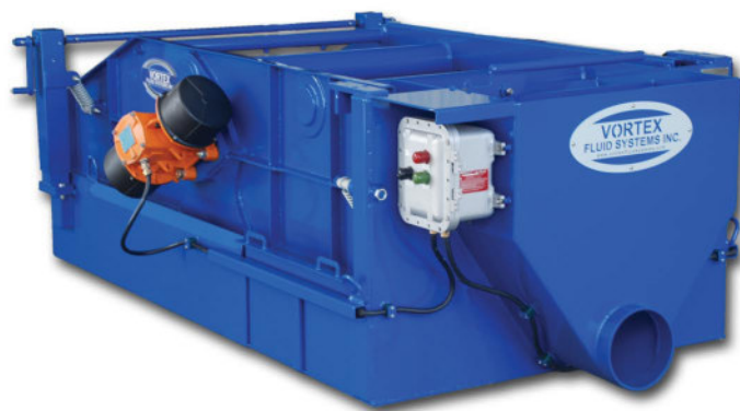
ORBITAL ® 3000 (BACK VIEW)